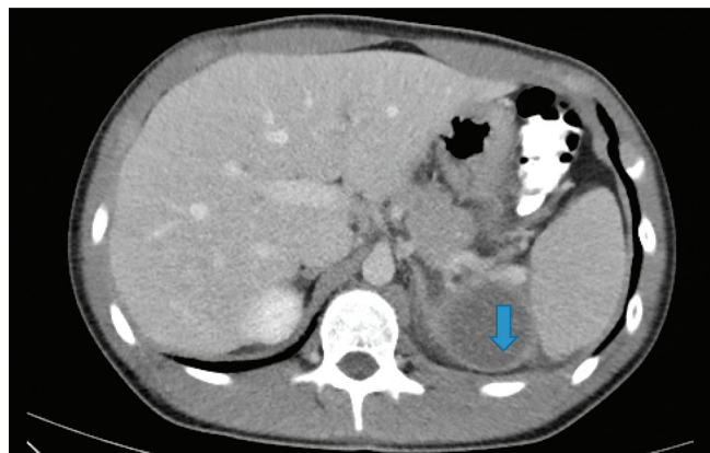
Figure 1. Initial contrast CT abdomen pelvis; arrow showing well-circumscribed intraperitoneal collection.

The care team performed EGD/EUS-guided gastrostomy on a cyst using a fully covered lumen apposing self-expanding metal stent (LASEMS; Boston Scientific AXIOS stent; 1.5 cm width) ( Figure 2 ). A moderate amount of purulent discharge was retrieved. After collecting a specimen for culture sensitivity, a thorough saline irrigation with 1 L of normal saline mixed with gentamicin was performed. Despite adequate antimicrobials based on results of culture and sensitivity of the aspirate from the collection (positive for C. albicans ), the patient continued to