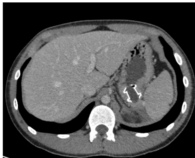
Figure 4. Contrast CT abdomen pelvis, 8week post initial procedure.