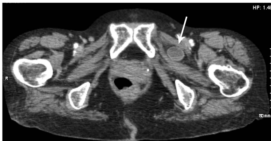
Figure 1. CT imaging revealing the location of a hernia sac between the obturator externus and pectineus muscles. Arrow: most common location for an obturator hernia.

ing to repair all hernias from our transabdominal vantage point would be difficult, because raising the requisite peritoneal flaps so low in the pelvis would provide a technical challenge. Therefore, we opted to convert to a TEP approach. Trocars were withdrawn, and the preperitoneal