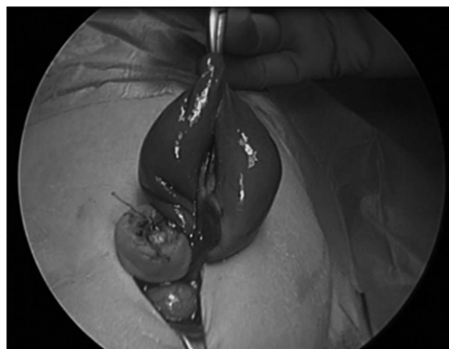
Figure 3. The annex was completely delivered through the 10-mm umbilical incision.

Histological examination showed extensive hemorrhagic necrotic autolytic tissue with dystrophic calcification, containing ovarian tissue and congestion of the ovarian vessels with thrombosis. The postoperative course was uneventful, and the patient was discharged on postoperative day 2.