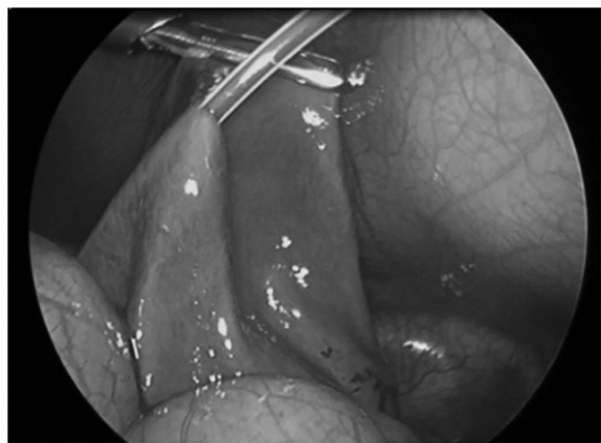
Figure 2. The annex was partially drained by an intravenous 14-gauge catheter inserted through the abdominal wall under direct laparoscopic vision.

through the umbilical incision using the Hasson technique. The abdomen was insufflated to a pressure of 6 mm Hg. A brown smooth cystic lesion measuring approximately 4.5 cm was found in the left iliac fossa.