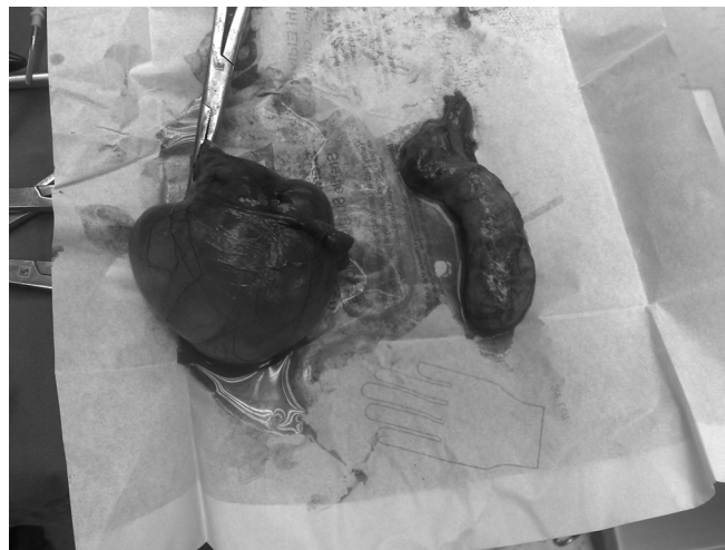
Figure 2. The retrieved tissues (cystic ovary on the left and hydropic gall bladder on the right) following cholecystectomy and salpingoophorectomy through the same midumbilical incision.

The length, weight, and body mass index of the woman were 159 cm, 67 kg, and 26.5 \text{ kg/m}^2 , respectively. The operative technique included the previously defined 1.5- to 2-cm midumbilical transverse incision, fixation and elevation of the entry site fascia with 2 stitches, elevation of the anterior abdominal wall by sutures loaded in the Veress cannula, and tying of the sutures over the preprepared sterile retractor. However, contrary to the previously defined gynecological operations, the first ends of the lifting sutures passed the abdominal wall from inside