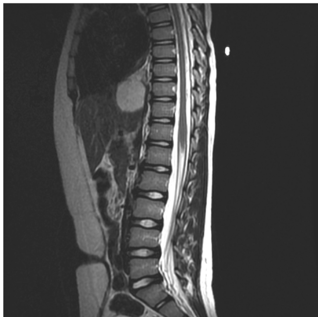
Figure 1. Magnetic resonance image showing posterior mediastinal cyst extending to the inferior cardiac border.