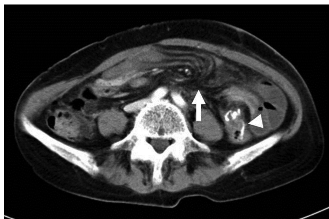
Figure 1. Computed tomography (A) on POD 14 showed converged, stretched, and engorged mesocolonic vessels (arrow) near the anastomotic segment (arrowhead) in the left upper abdomen.

muscularis propria but without lymph node metastasis. The final diagnosis was made as S, type1, MP, ly0, v0, ow(-), aw(-), N0, P0, H0, M0, stage 1.