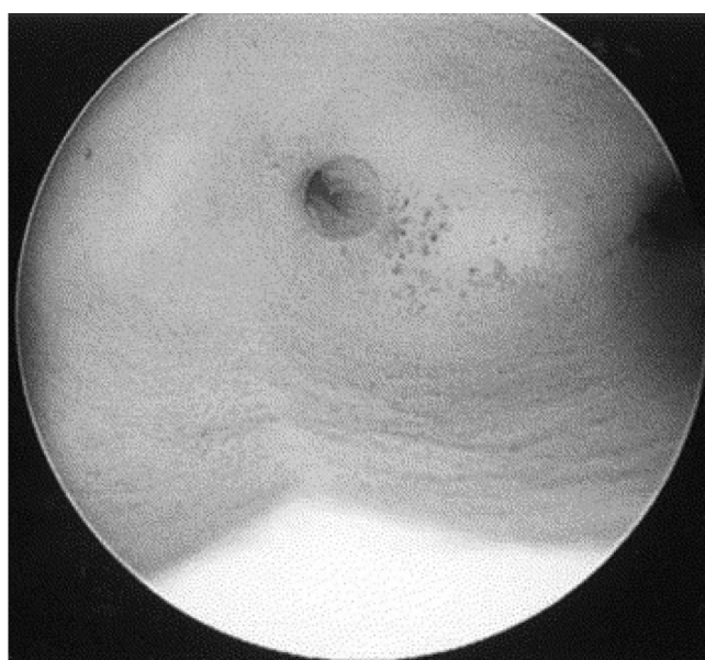
Figure 3. Hysteroscopy of a unicornuate uterus with a noncommunicating rudimentary horn.

cavity was found to be noncommunicating with the left rudimentary horn ( Figure 3 ). Laparoscopy was started with the injection of blue dye through the cervix into the uterus. A clear passage of blue dye was observed on only the right tube, establishing the diagnosis of a left noncommunicating horn. On exploration of the pelvis, clinicians discovered that the rudimentary horn, measuring 4 cm, was attached to the unicornuate uterus by a 20-mm-diameter band of tissue. The left pararectal space was opened, and the iliac vessels and ureter were visualized. A left