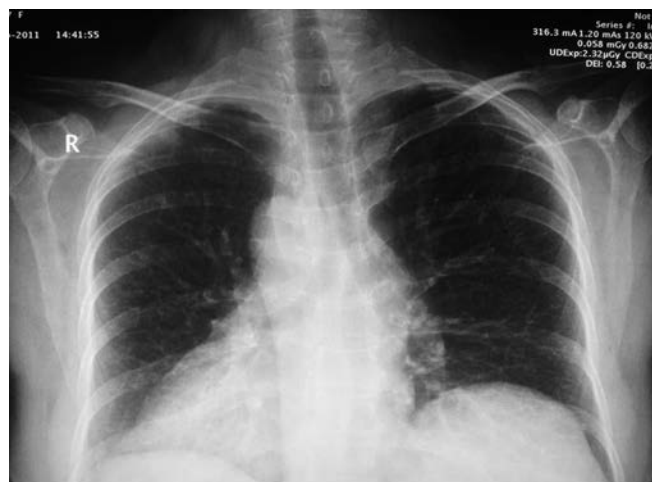
Figure 1. Case 1: Chest radiograph showing dextrocardia.