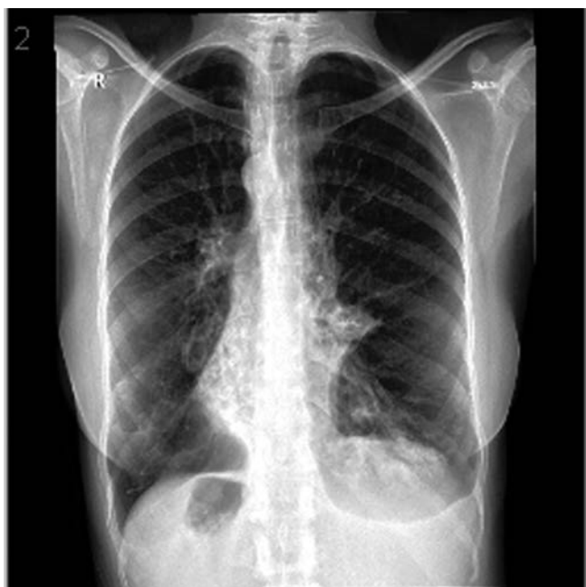
Figure 4. Case 2: Chest radiograph showing dextrocardia with bronchiectasis.

tomy by the same surgeon. However, the approach in the operating room required modification.