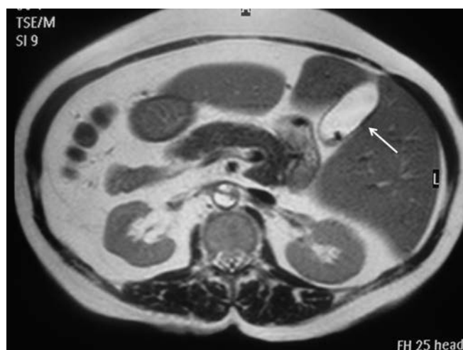
Figure 2. Case 1: MRCP showing visceral SI with multiple gall bladder stones in a left-sided gall bladder (arrow).

bladder ( Figure 2 ) with a normal caliber common bile duct without ductal anomalies ( Figure 3 ). A diagnosis of acute cholecystitis and SIT was made. After 24 hours of receiving intravenous antibiotics, the patient was taken to the operating room for laparoscopic cholecystectomy. She had an uneventful recovery and was discharged home on the first postoperative day. Pathologic examination of the specimen revealed chronic calcular cholecystitis with cholestrolosis.